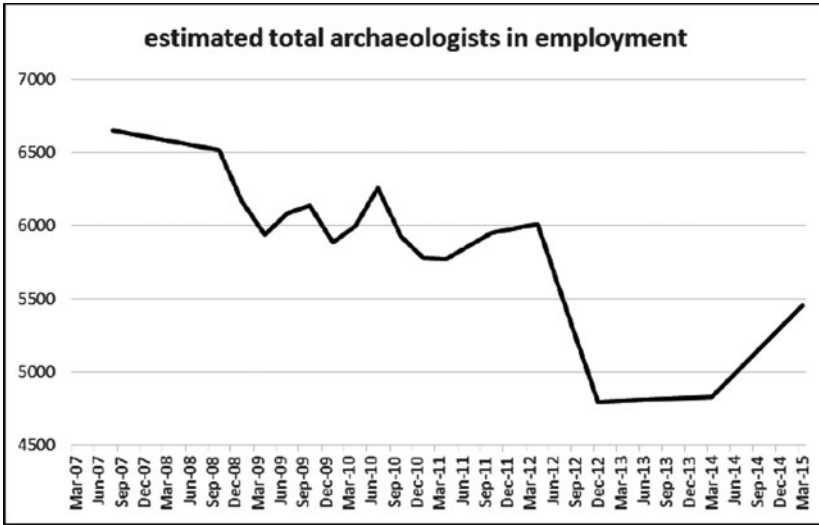
Figure 1 Estimated total archaeologists in employment in England (March 2007–March 2015). Aitchison (2015, 16).